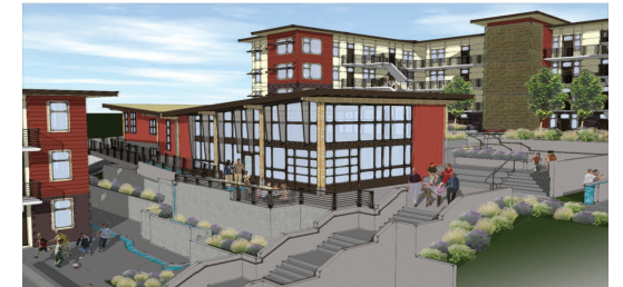
YWCA Family Village - Issaquah Highlands

Funded in 2008 and 2009, construction started in 2010. Will provide 146 units of rental housing