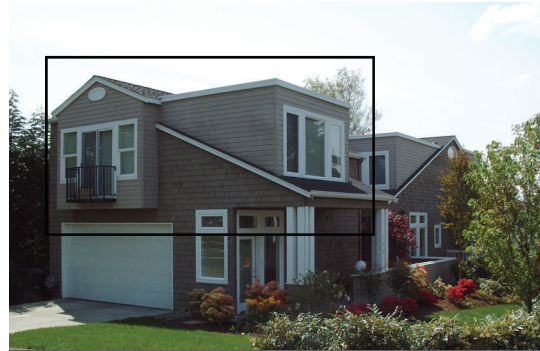
The box highlights an Accessory Dwelling Unit (ADU) above a garage